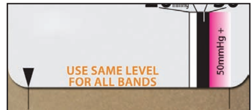
▲ Fig. C Too much tension for 30-50mmHg, Set to 50mmHg+

REMEMBER: The Juxta-Fit™ legging should never hurt. It should feel firm but comfortable. If pressure increases or decreases noticeably during wear, loosen or tighten any bands. Always ensure, however, that the correct prescribed pressure range is being applied. Slightly loosen the bands of the legging for night time wear. Each set of vertical guidelines may be at a different location on the leg depending on the size and shape of the leg. They do not need to be aligned down the front center of the leg or in any other specific location on the leg. The Comfort Compression Anklelet™ may be worn day and night, but it is recommended that the Comfort Compression Anklelet™ be removed if experiencing discomfort when laying down. The anklelet can be worn over the legging if sensitivity to the ribbed edge is a concern.