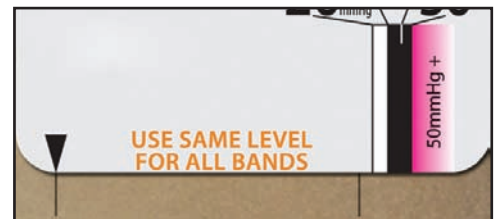
▲ Fig. B Not enough tension for 30-50mmHg