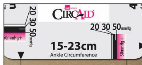
▲ Fig. C Too much tension for 30-50mmHg, Set to 50mmHg+

REMEMBER: The Juxta-Fit™ legging should never hurt. It should feel firm but comfortable. If pressure increases or decreases noticeably during wear, loosen or tighten any bands. Always ensure, however, that the correct prescribed pressure range is being applied. Slightly loosen the bands of the legging for night time wear. Each set of vertical guidelines may be at a different location on the leg depending on the size and shape of the leg. They do not need to be aligned down the front center of the leg or in any other specific location on the leg.