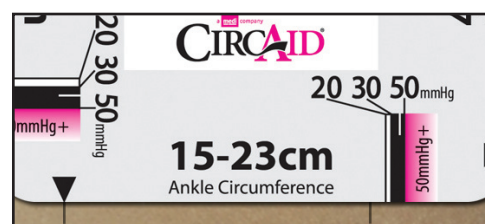
▲ Fig. B Not enough tension for 30-50mmHg