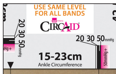
▲ Fig. A Correctly Adjusted for 30-50mmHg

Disengage each band of the legging, starting at the top and working your way down. Fold each band back onto the body of the garment. Do not tightly roll the band back onto itself as this will cause the hook material to bend, reducing its adherence strength. When complete, the garment should resemble its starting position for easy reapplication. Lastly, slide the liner off the leg.