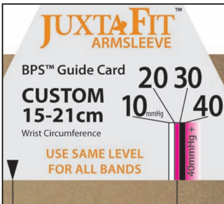
▲ Fig. A Correctly Adjusted for 20-30mmHg

STEP 5: Repeat BPS™ Steps 2-4 for each band going up the arm. Be sure to adjust to the SAME tension on the BPS™ card scale as the bottom band. Bands may need adjusting throughout the day to maintain the prescribed pressure range.