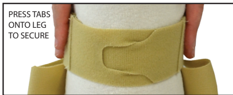
PRESS TABS ONTO LEG TO SECURE